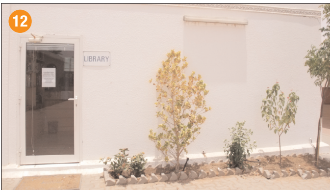
Living Water Library