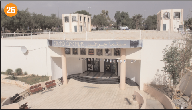
Grand Cinema, next to the Rotana