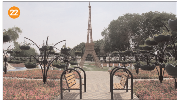
This direction to the Paradise Hanging Gardens