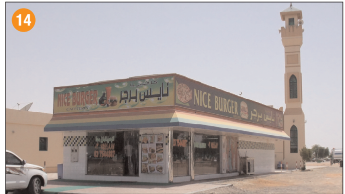
Nice Burger Restaurant