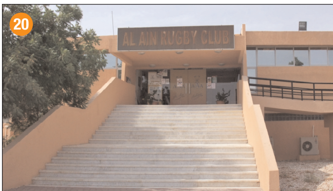
Palm Resort / Rugby Club