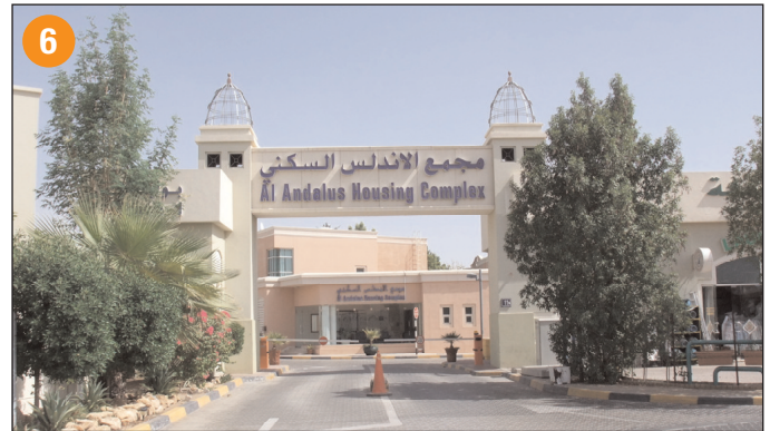
Al Andalus Housing Complex, where a lot of expats live