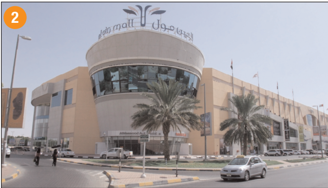
Al Ain Mall