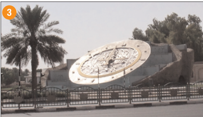
Clock Tower 'Roundabout'