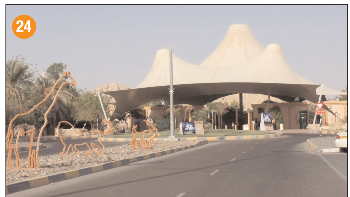
Al Ain Wildlife Park