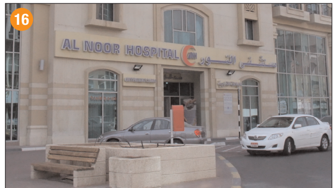
Al Noor Hospital