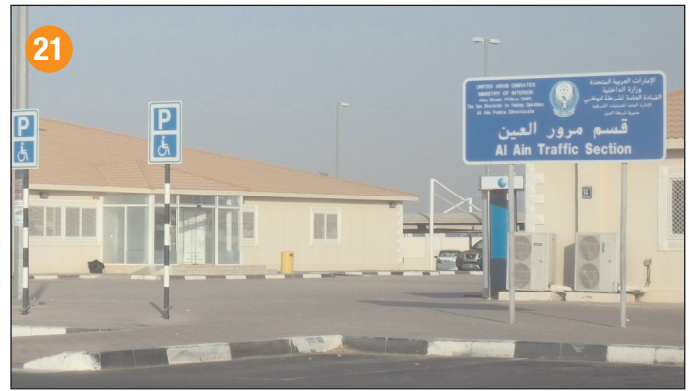
Al Ain Traffic Section: where you pay car-related fines; where you take your driving test