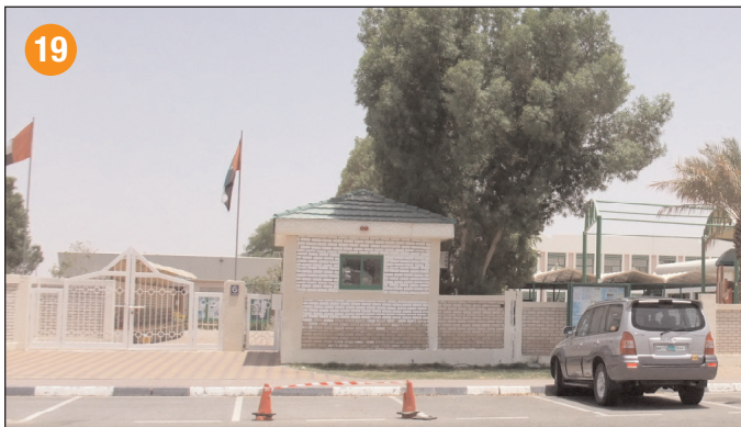
Al Ain English Speaking School