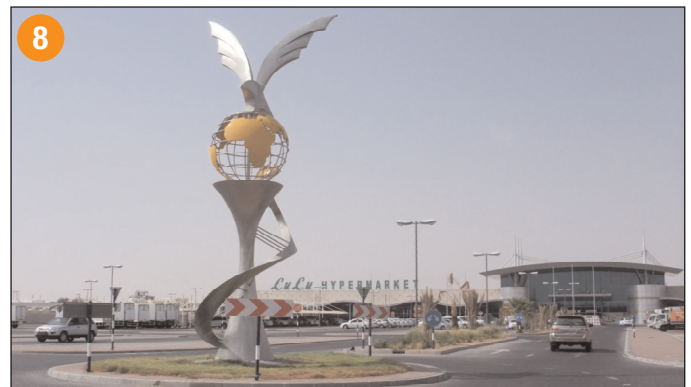
Lulu Hypermarket, Kuwaitat