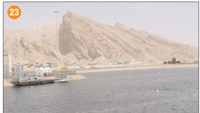
This direction to Green Mubazzarah and Jebel Hafeet