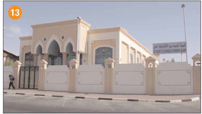
St Mary's Catholic Church