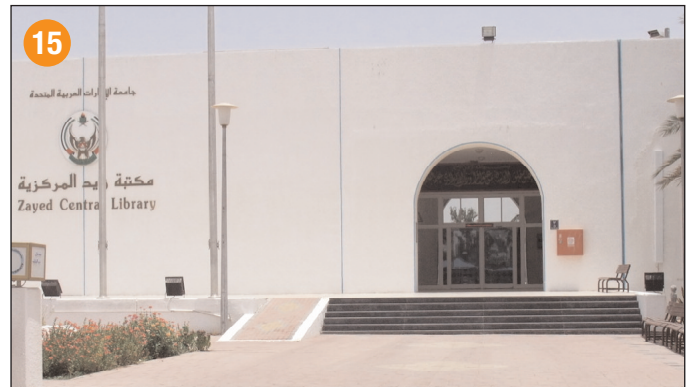
Zayed Central Library